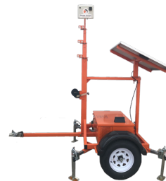
Traffic Detection Trailers