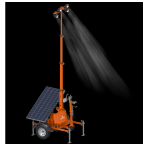
Solar Light Towers