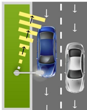
Armadillo on the side with 2 lanes incoming. No outgoing lanes can be detected