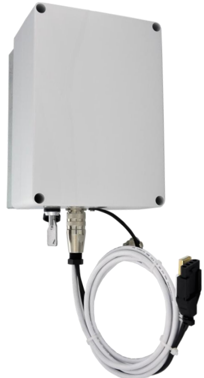
Armadillo Tracker Radar Stats Collector

© 2005 to 2014 Houston Radar LLC 12818 Century Drive, Stafford, TX 77477 http://Houston-radar.com Toll Free: 1-888-602-3111