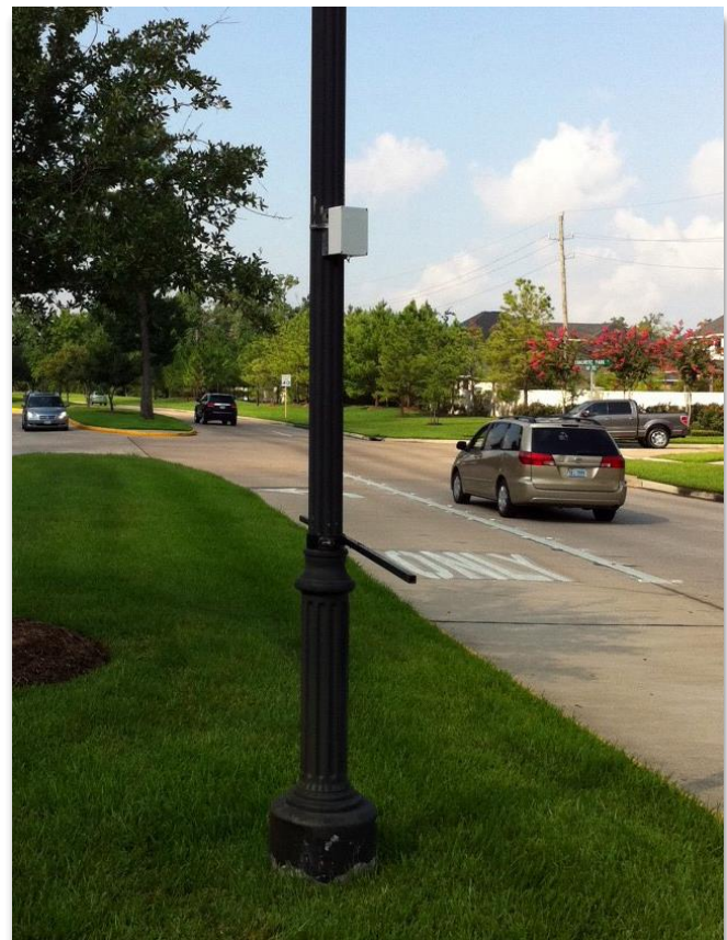
Armadillo mounted on light pole collecting data