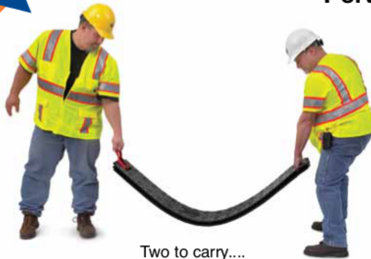
Two to carry....

Ideal for Work Zones where daily installation and removal is required