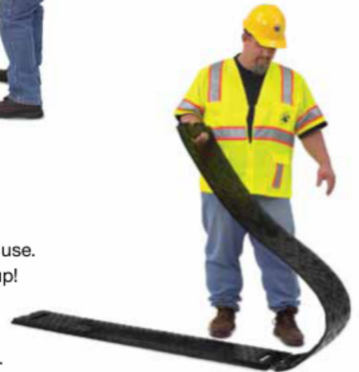
...one to unfold.