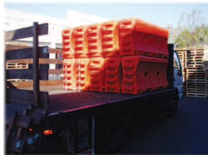
Water-Wall stacks for storage and transportation.