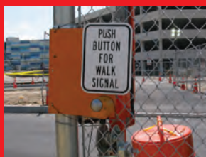
Push To Walk Actuation