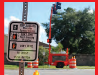
Easily Retrofitted to SQ3TS™ System