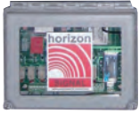
Remote Monitoring System