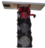
Solar Charging Package